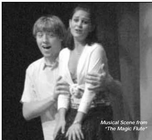
Musical Scene from "The Magic Flute"

*One to three hours of credit from the State University of New York, College at Oneonta (SUCO) may be awarded to students that successfully complete all qualifying class and individual instruction assignments as determined by the SUCO Music Department. Students may also enroll in and take regular SUCO courses for an additional fee. Please visit www.nysmf.org for more information.