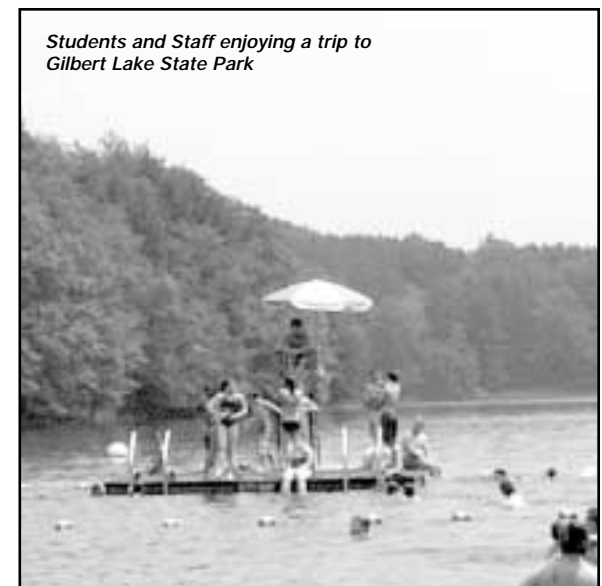
Students and Staff enjoying a trip to Gilbert Lake State Park

Concert Crew members must be 18 years of age or older and qualify for a counselor position. They are responsible for all equipment used by NYSMF, reporting directly to the administration, and work closely with our conductors and faculty members to ensure smooth rehearsals and performances. CC members receive a full scholarship, private lessons, and a small stipend at the end of each session.