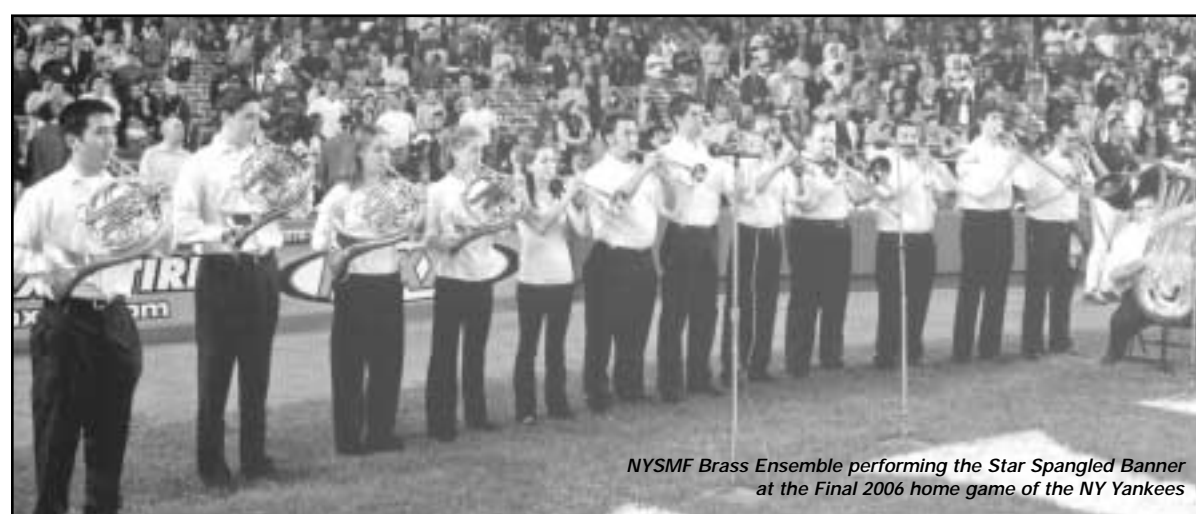
NYSMF Brass Ensemble performing the Star Spangled Banner at the Final 2006 home game of the NY Yankees