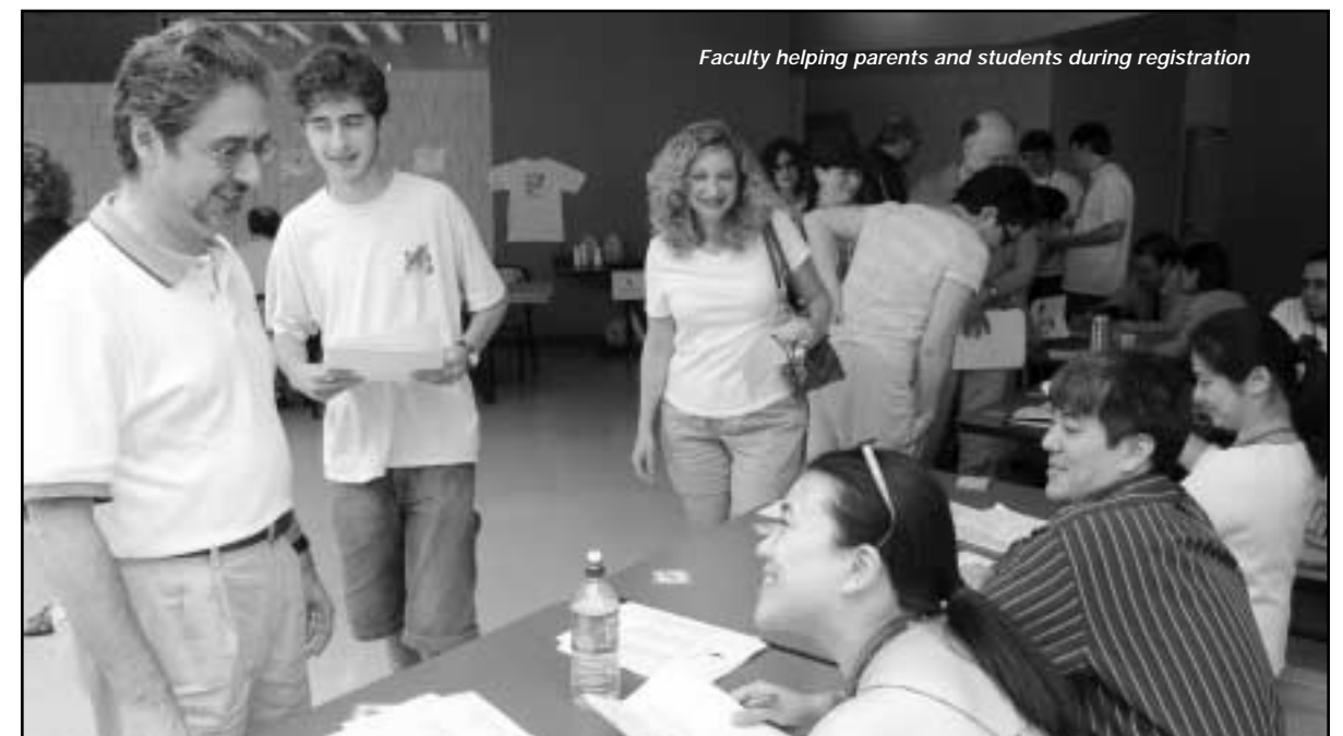
Faculty helping parents and students during registration