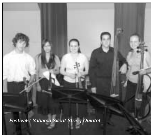
Festivals' Yamaha Silent String Quintet

Types and sizes of ensembles vary for different instruments: Bass Ensemble, Brass Ensembles, Cello Ensembles, Clarinet Ensembles, Flute Ensembles, Guitar Ensembles, Jazz Combos, Percussion Ensembles, Piano Ensembles, Vocal Chamber Ensembles, and various others. Performances by these ensembles take place at various times during the final weekend of each session.