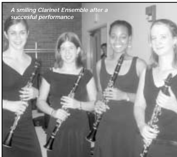
A smiling Clarinet Ensemble after a successful performance