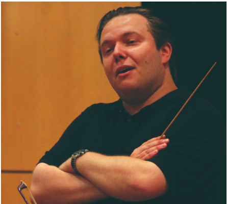
IGNAT SOLZHENITSYN, Conductor / Piano