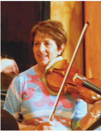
IDA KAVAFIAN, Violin